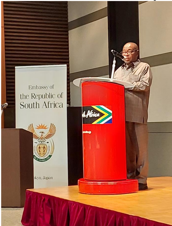
Minister Nchimande gave keynote address during the workshop attended by representatives from South African and Japanese companies