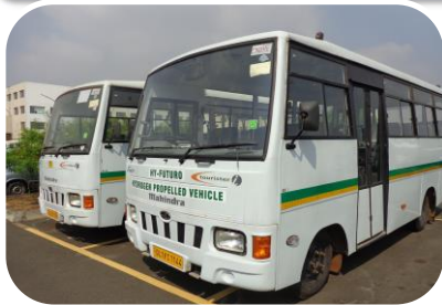
2 mini-buses based on Hydrogen ICE

4 new projects were supported during 1 April, 2016 to 31 October, 2016 4 more new projects likely to be supported by 31 March, 2017