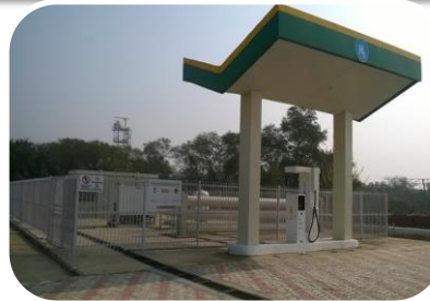
Hydrogen refueling facility at NISE, Gwal Pahari, Gurgaon