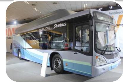
10 Fuel Cell buses are under development by Tata Motors Ltd