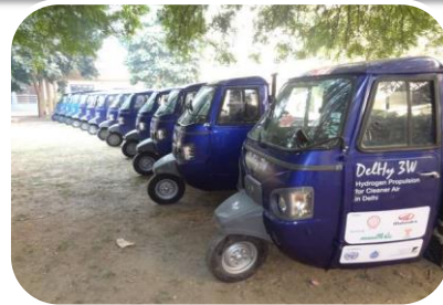
15 Hydrogen fuelled 3-wheelers